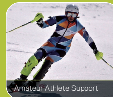
Amateur Athlete Support