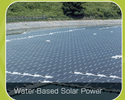
Water-Based Solar Power