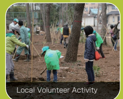
Local Volunteer Activity

*Taiyo Holdings Co., Ltd. concluded a business alliance with DIC Corporation on January 25, 2017. Press release: http://www.taiyo-hd.co.jp/_cms/wp-content/uploads/2017/02/20170202_01_en.pdf