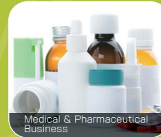
Medical & Pharmaceutical Business