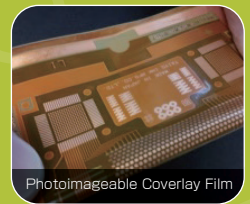
Photoimageable Coverlay Film